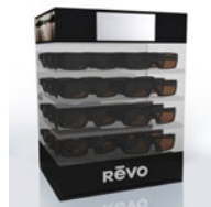
12 - 16 - PIECE COUNTER TOP