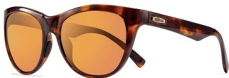
BARCLAY - RE1037