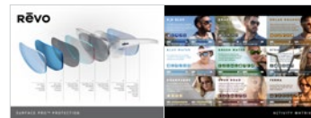
6X8 COUNTER CARD 6 - 2 FOLD DISPLAY