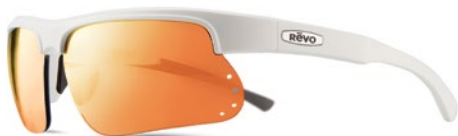
CUSP S - RE1025