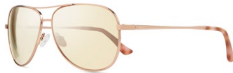
RELAY - RE1014