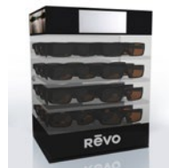
24 - PIECE COUNTER TOP