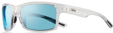
CRAWLER - RE1027