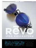
6X8 COUNTER CARD 5