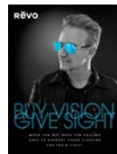
6X8 COUNTER CARD 4