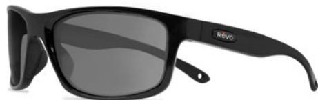
HARNESS - RE4071