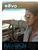
6X8 COUNTER CARD 2