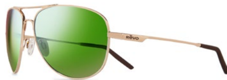
WINDSPEED - RE3087