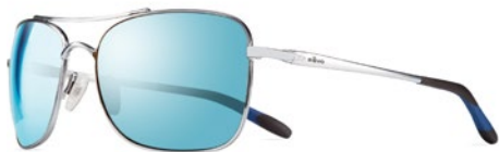
TERRITORY - RE1034