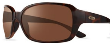
FAIRWAY - RE1042