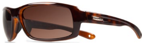
CAMBER - RE4064X