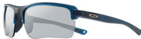
CRUX C - RE1021