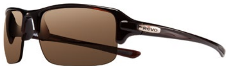
ABYSS - RE4041X