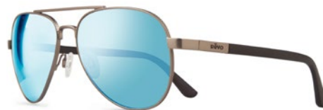
RACONTEUR - RE1011