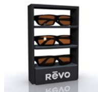
3 - PIECE VERTICAL DISPLAY