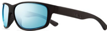
BASELINER - RE1006