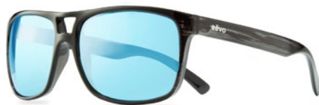
HOLSBY - RE1019