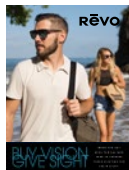
6X8 COUNTER CARD 1