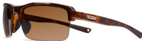
CRUX N - RE4066