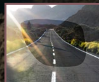
Image intensifier filters improve light adaptation whether in bright or low light situations while also precision-tuning light transmission for greater sharpness, crispness and contrast