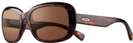
PAXTON - RE1039