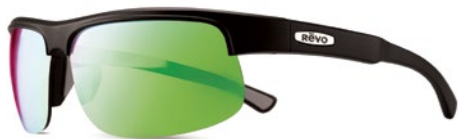
CUSP C - RE1024