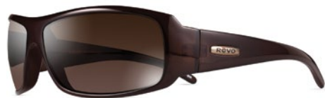
GUNNER - RE5010