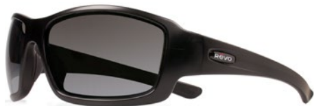
BEARING - RE4057